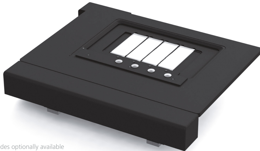
Stage insert for 4 slides optionally available