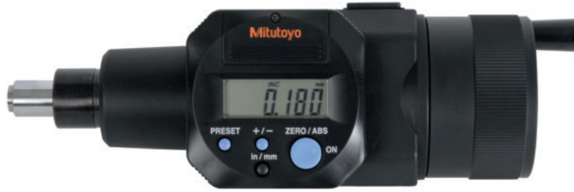
Digital Micrometer, Order No. 00-99-901-4889